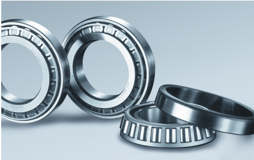
TF Series Bearings

NSK's TF Series Bearings have been designed for outstanding toughness under harsh conditions. They combine longer service life & superior resistance against wear, seizure & heat (also in contaminated lubrication).